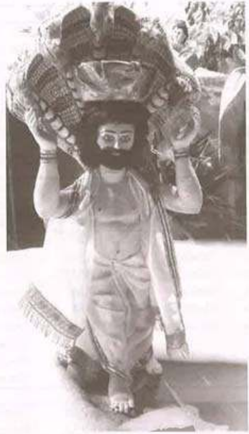
Tableau on Janamashtami

equal enthusiasm. Special Prasad ( Malpoas ) was distributed as an expression of joy on account birthday of Lord Krishna.