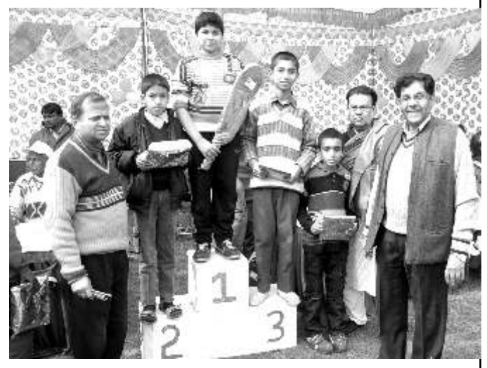
Winners at the Rostrum

to display their vigour and muscles. With the blowing of the whistle by the Master, about 50 Tiny Tots in their colourful dresses started their Flat Race. This was in inaugural item of Annual Sports and subsequently other events followed. New Events were introduced this year for boys, girls, ladies and gents. Arithmetic Race, Biscuit Race, Breaking the Pitcher by ladies and Musical Chair were most attractive ones.