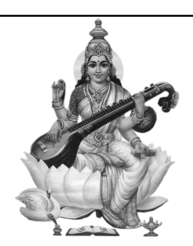
'SARASWATI PUJA' AND 'HATHEY KHORI' ON 12th FEBRUARY 2016 AT 9.00 A.M.

KMS garden has started blooming. Absence of continuous fog and bright sunshine has helped our Garden Sevayats to earn maximum mileage and the garden with seasonal and other flowers have started showing results. As you enter the Mandir Complex you would be greeted with lush green lawn, neat and clean ambience and the upcoming flower plants. Within the next fifteen days, our garden would be full bloomed and the ensuing Flower Show on 7th March 2016 would be a great panorama. Flower growers in our colony would be equally happy with the natures' gift in their gardens and participate in large numbers at the Annual Flower Show.