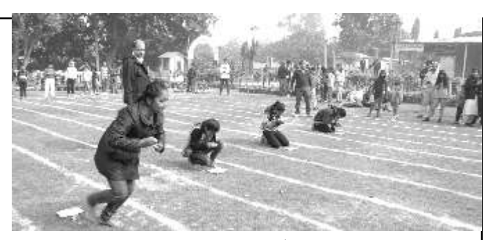
Participants in Action

The sky was overcast in the morning but gradually bright sun shine started appearing as the day advanced. Fully charged Athletes in proper kits assembled in the lush green lawns