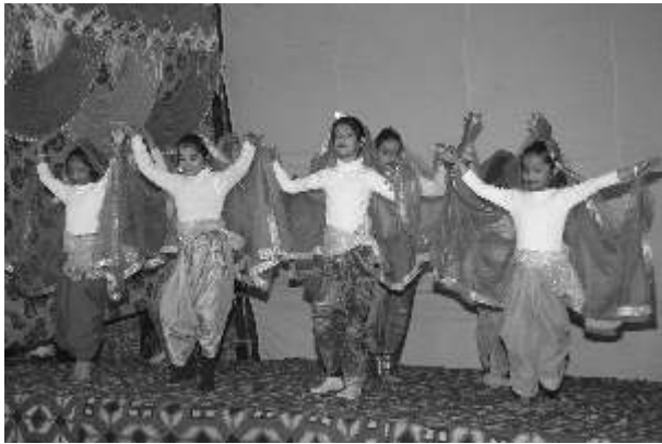
Sequence from 'Pollution'

auspicious day. It was fascinating to see the little kids carrying slate, chalk and a fancy bag on their back, adorned in traditional "Dhoti Kurta" visiting the temple, holding the fingers of their parents, grand parents and waiting for their turn to perform initiation of "Hatey Khari" by our respected priests, with a deep rooted belief that performance of "Hatey Khari" on this auspicious day of Sri Sri Saraswati Puja, enables a child to make good progress in his / her studies.