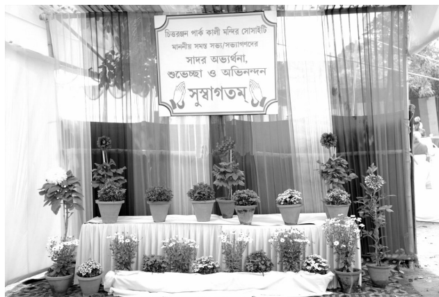
Decorated Entry Gate

A relaxed Sunday, was on 28th February, 2016, where the Members of KMS assembled at the lush green spruced lawn of Mandir Prangan, the rendezvous of the Annual Members' Day. Bright sun shine, piercing through the rainbow sheet spread overhead, decorated gates and flower decked stage, all made the arena a grand festive look. This was the annual in-house get-together of the Members, for which Managing Committee as well as the Members eagerly wait for this D-Day. President, Secretary and other Office Bearers, all were at the decorated entry-point to receive the guests with warm welcome 'Namaskar' with a red rose.