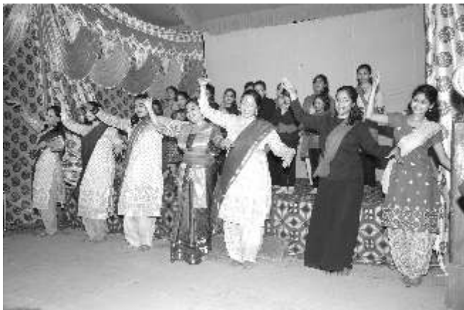
Sequence from 'Pollution'