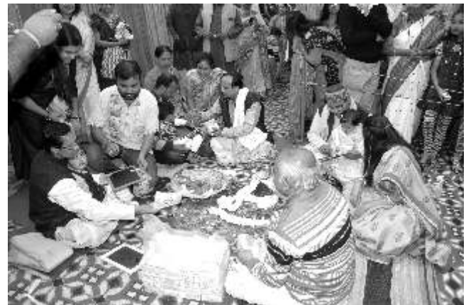
Hathey Khari in Progress

হে মহাভাগে, বিদ্যাস্বরূপে, কমললোচনে, বিশ্বরূপে, বিশালাক্ষি সরস্বতী, আমায় বিদ্যা দাও, তোমায় কোটি কোটি নমস্কার।