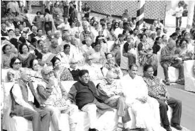
A Section of Audience

The rendezvous was aesthetically and tastefully decorated with spotless white covered chairs laid out, small round tables for family homily and the guests were affectionately directed to the Tea / Coffee counters, where mouth watering hot, delicious and spicy pakoras were laid out on clean tables. The guests did not wish to waste any time to gulp the plates of tasty potato, cauliflower, chilli, spinach and paneer pakoras, which were laid in ample quantities to enable the guests to go even for repeat servings. The broad smiles of the guests amply demonstrated their likings of the entire friendly ambience.