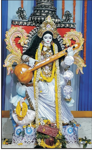
Magnificent Saraswati Idol

Saraswati Puja, which is popularly known as the Puja for students to empower them for their knowledge and studies and they seek the blessings of MAA SARASWATI. Students community start the preparation for 'Basant Panchami' Goddess of Learning and Music months ahead to celebrate in a befitting manner. Most of the Pujas are celebrated in schools, colleges, educational institutions and music centres. In Kali Mandir, Saraswati Puja was