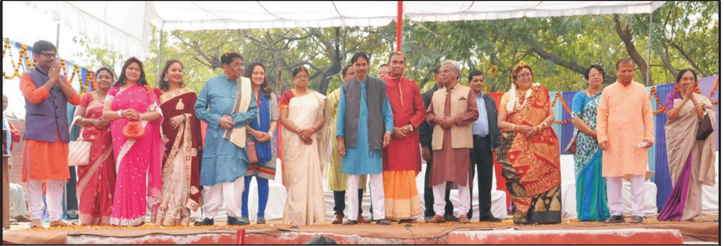
Group Photograph of Artists of 'UTSAV'

the rendezvous of the Annual Member's Day. The Annual Member's Day turned into an in-house get-together of the Members is an important event of the Mandir Calendar. It was a D-Day President, Secretary and other Office Bearers were all present at the decorated entry point to receive the guests with a warm welcome 'NAMASKAR'. The rendezvous was aesthetically and tastefully decorated with spotless white covered chairs and sofas, small round tables for family homily and the guests were affectionately directed to tea / coffee counters where mouth watering hot, delicious and spicy pakoras were laid out on clean tables.