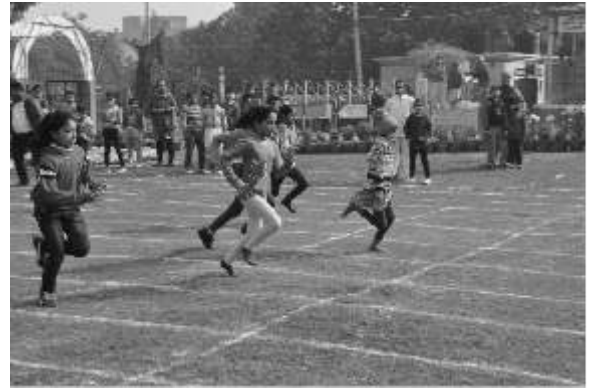
"ON YOUR MARK, READY, STEADY, GO"