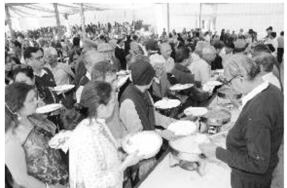
GUESTS FOR SUMPTUOUS LUNCH