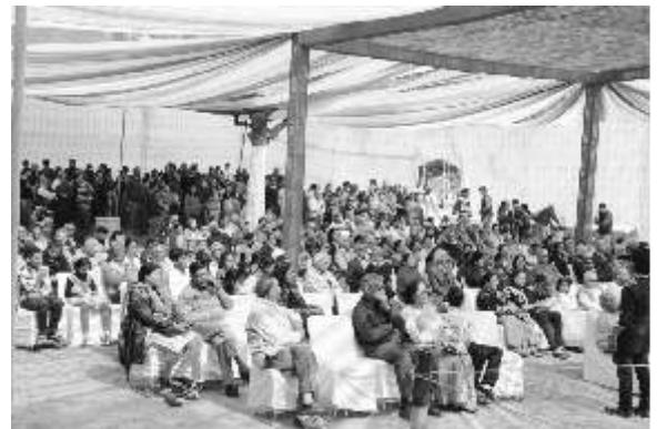
PACKED AUDIENCE AT MEMBER'S DAY