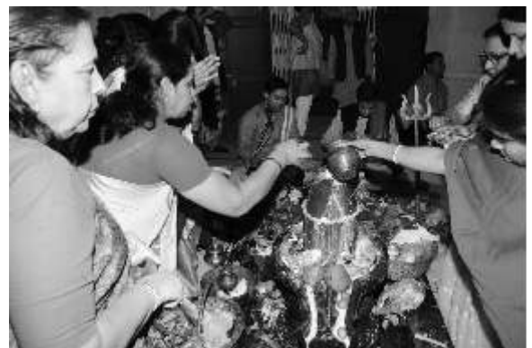
SOLEMN SHIVA RATRI CELEBRATION