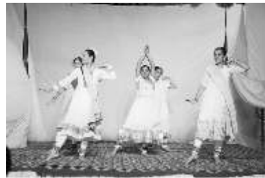
Dance Program in Progress

Sri Sri Neel Puja was predominantly a ladies day. From morning to late in the evening, ladies, attired in ceremonial clothes turned up and made floral offerings to Lord Shiva. The turnout of devotees was so large that it resembled as Mahashivratri Utsab.