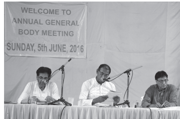
Officials at the Dais

One of the annual rituals of Kali Mandir Society is to interact with its Members in an Annual General Body Meeting, held on Sunday, 5th June 2016 at the Mandir Complex. The basic purpose of such interactions is to take