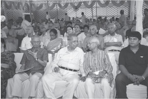
Members in Attendance

stock of the work done during the last one year and Member's feedback on the performance of Managing Committee on whose shoulders the onus of running the Mandir's activities lies, to the satisfaction of Members and Devotees.