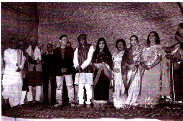
This hilarious play 'MAYAR KHELA' written and

Parents always remain worried about their teen aged unmarried girls, especially when they happen to reach home late. The said scenario prevailed in the case of 'Bubli'. But smart, good looking educated Bubli was fully conscious about herself, her future life and her obligations towards her parents. Keeping a balance she knew where to draw the line. The end was a happy antidote.